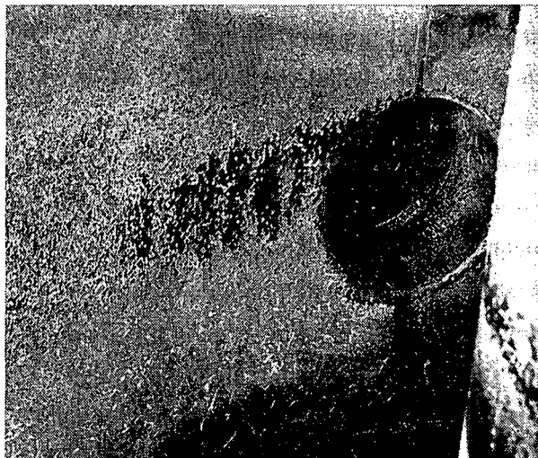
FIGURE 1b: An identical tank in mild steel under same conditions as tank in 1a. Shows heavy pitting attack.