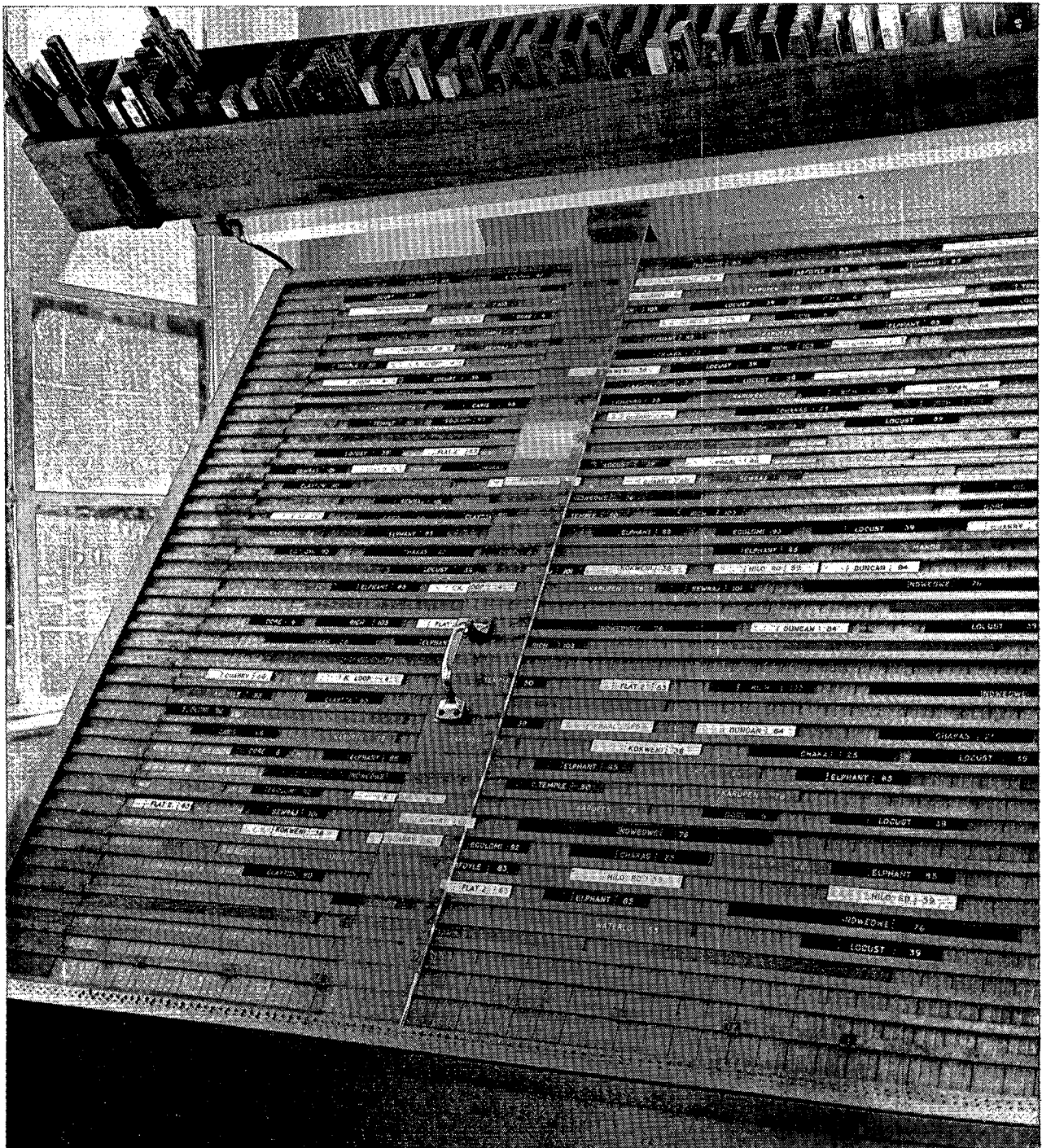
A general view of the vehicle scheduling board.

These have been staggered in order to indicate a bunching effect. Standards were used to make up a number of chips indicating the time that a vehicle should take to travel from the factory to the loading