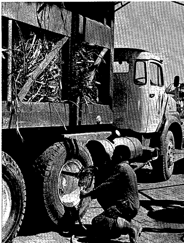
The use of an impact wrench to speed up the wheel changing process.

The use of modern power tools has speeded up many of the repair procedures. The introduction of staggered servicing shifts has reduced the number of vehicles off at any particular time for servicing.