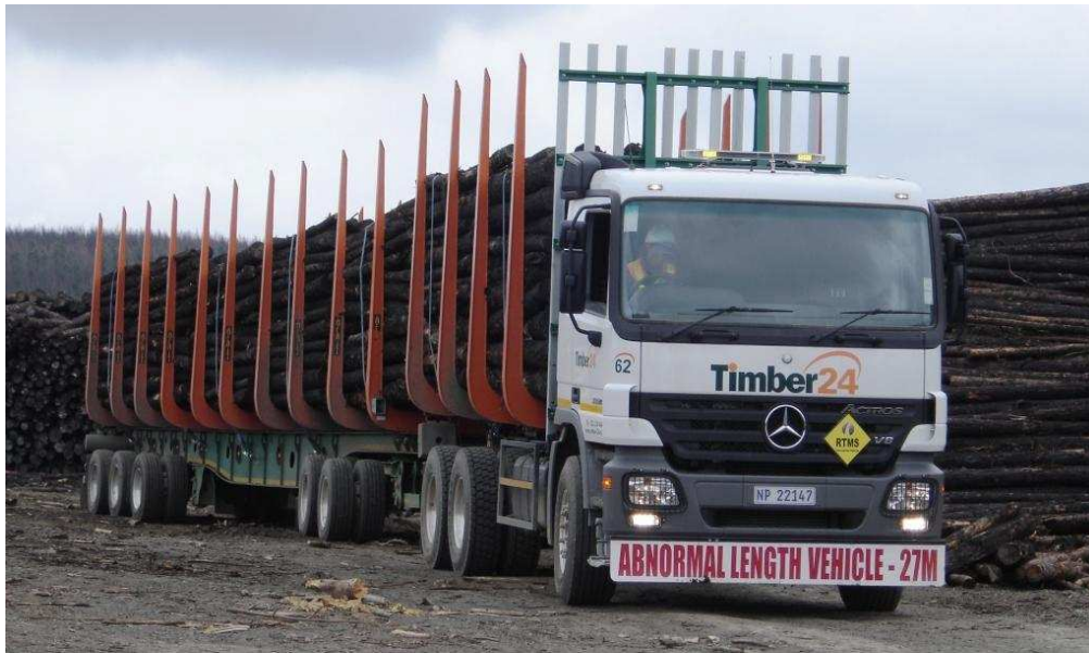
Figure 4. The as-built PBS truck-trailer.

Initial feedback from drivers has been very positive in terms of stability and manoeuvrability, which supports the improved performance features evidenced in the PBS vehicle compared with the baseline vehicle.