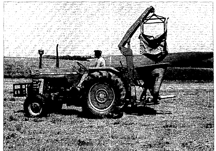
FIGURE 3 The tractor-mounted crane/spreader

fertilizer stopped as soon as the level of the fertilizer in the spreader bin reached the outlet of the funnel. As the level of the fertilizer inside the bin dropped, more fertilizer was released from the suspended bag and only when the bag was empty was another full bag lifted into position (see Figure 3).